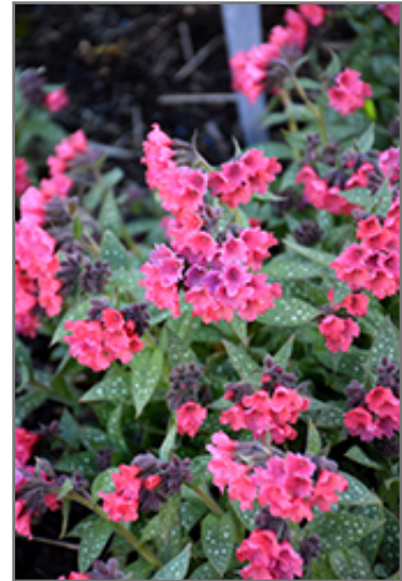
Shrimps On The Barbie Lungwort flowers

This is a relatively low maintenance plant, and should be cut back in late fall in preparation for winter. It is a good choice for attracting bees, butterflies and hummingbirds to your yard, but is not particularly attractive to deer who tend to leave it alone in favor of tastier treats. It has no significant negative characteristics.