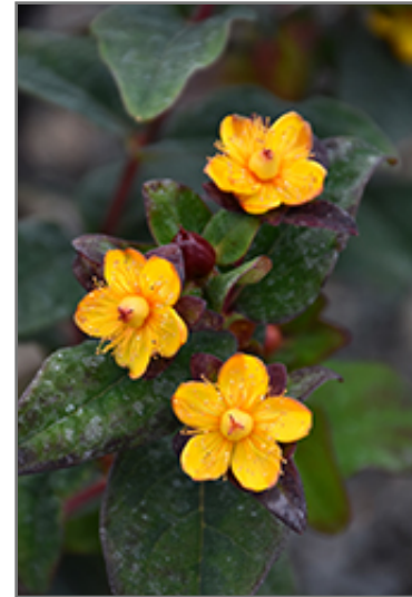
Magical Universe St. John's Wort flowers