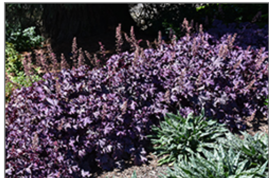
Grande Amethyst Coral Bells in bloom