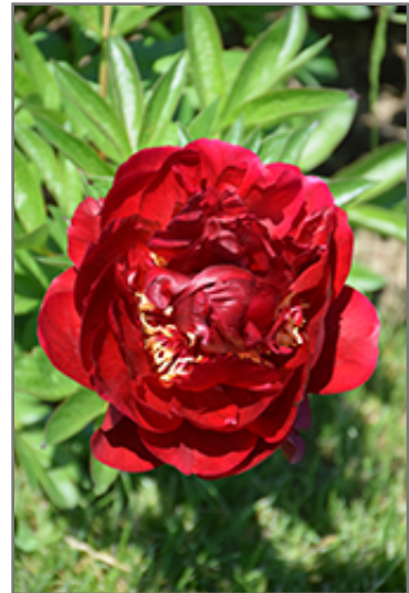
Buckeye Belle Peony flowers