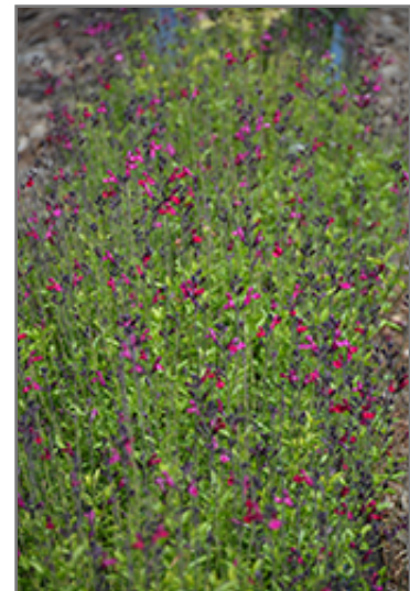
Vibe Ignition Fuchsia Sage in bloom