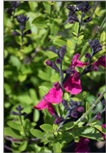
Vibe Ignition Fuchsia Sage flowers

Vibe Ignition Fuchsia Sage is a fine choice for the garden, but it is also a good selection for planting in outdoor pots and containers. With its upright habit of growth, it is best suited for use as a 'thriller' in the 'spiller-thriller-filler' container combination; plant it near the center of the pot, surrounded by smaller plants and those that spill over the edges. Note that when growing plants in outdoor containers and baskets, they may require more frequent waterings than they would in the yard or garden.