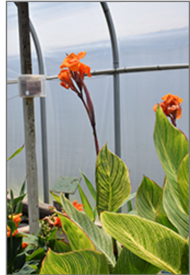
Bengal Tiger Canna flowers

This plant should only be grown in full sunlight. It requires an evenly moist well-drained soil for optimal growth, but will die in standing water. It is not particular as to soil pH, but grows best in rich soils. It is highly tolerant of urban pollution and will even thrive in inner city environments, and will benefit from being planted in a relatively sheltered location. Consider applying a thick mulch around the root zone in winter to protect it in exposed locations or colder microclimates. This particular variety is an interspecific hybrid. It can be propagated by division; however, as a cultivated variety, be aware that it may be subject to certain restrictions or prohibitions on propagation.