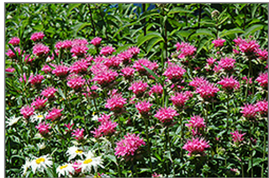
Marshall's Delight Beebalm flowers