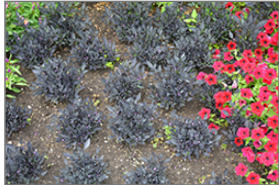
Onyx Red Ornamental Pepper

This plant will require occasional maintenance and upkeep, and should not require much pruning, except when necessary, such as to remove dieback. It is a good choice for attracting bees and butterflies to your yard, but is not particularly attractive to deer who tend to leave it alone in favor of tastier treats. It has no significant negative characteristics.