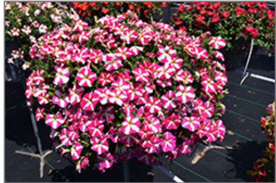
Amore Pink Heart Petunia in bloom

Amore Pink Heart Petunia will grow to be about 12 inches tall at maturity, with a spread of 14 inches. When grown in masses or used as a bedding plant, individual plants should be spaced approximately 10 inches apart. Its foliage tends to remain dense right to the ground, not requiring facer plants in front. This fast-growing annual will normally live for one full growing season, needing replacement the following year.