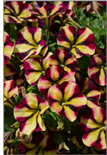
Amore Fiesta Petunia flowers

This plant will require occasional maintenance and upkeep. Trim off the flower heads after they fade and die to encourage more blooms late into the season. It is a good choice for attracting butterflies and hummingbirds to your yard, but is not particularly attractive to deer who tend to leave it alone in favor of tastier treats. It has no significant negative characteristics.