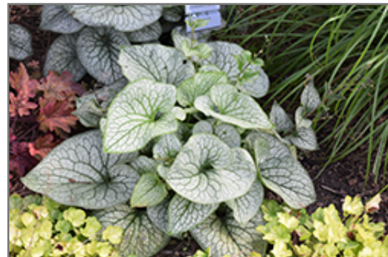
Queen of Hearts Bugloss foliage