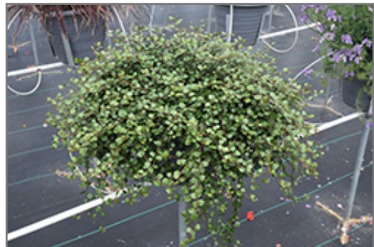
Big Leaf Creeping Wire Vine