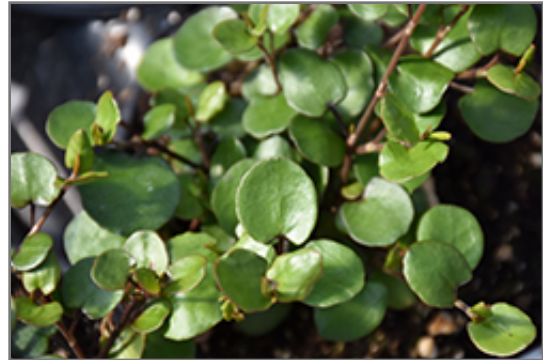
Big Leaf Creeping Wire Vine foliage

Big Leaf Creeping Wire Vine makes a fine choice for the outdoor landscape, but it is also well-suited for use in outdoor pots and containers. Because of its spreading habit of growth, it is ideally suited for use as a 'spiller' in the 'spiller-thriller-filler' container combination; plant it near the edges where it can spill gracefully over the pot. It is even sizeable enough that it can be grown alone in a suitable container. Note that when grown in a container, it may not perform exactly as indicated on the tag - this is to be expected. Also note that when growing plants in outdoor containers and baskets, they may require more frequent waterings than they would in the yard or garden.