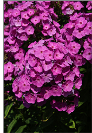
Garden Girls Cover Girl Garden Phlox flowers