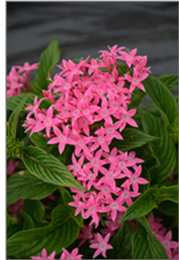
Lucky Star Pink Star Flower flowers

Lucky Star Pink Star Flower is recommended for the following landscape applications;