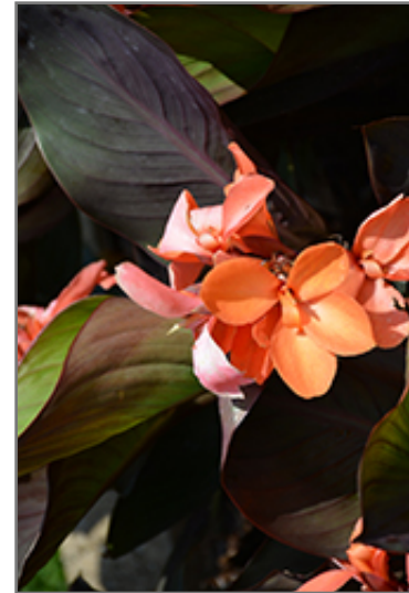
CannaSol Happy Wilma Canna flowers

This plant is native to the tropics and prefers growing in moist environments with evenly warm conditions all year round. In our climate, it is usually grown as an outdoor annual in the garden or in a container. If you want it to survive the winter, it can be brought in to the house and provided with special care, and then returned to the garden the following season. In its preferred tropical habitat, it can grow to be around 18 inches tall at maturity, with a spread of 14 inches. However, when grown as an annual or when overwintered indoors, it can be expected to perform differently, and its exact height and spread will depend on many factors; you may wish to consult with our experts as to how it might perform in your specific application and growing conditions.