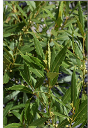
Emerald Wave Sweet Bay foliage

Emerald Wave Sweet Bay is recommended for the following landscape applications;