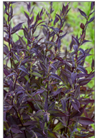
Lady In Black Calico Aster