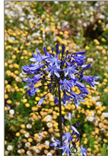
Blue Leap Agapanthus flowers

Blue Leap Agapanthus is recommended for the following landscape applications;