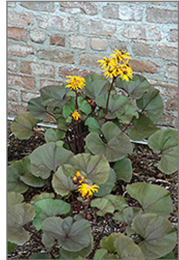
Britt Marie Crawford Rayflower in bloom