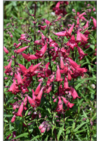
MissionBells Deep Rose Beard Tongue flowers

MissionBells Deep Rose Beard Tongue is recommended for the following landscape applications;