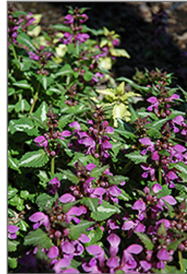
Elisabeth de Haas Spotted Dead Nettle flowers