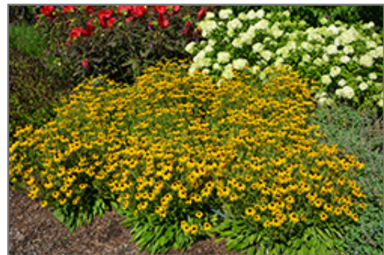
American Gold Rush Coneflower in bloom