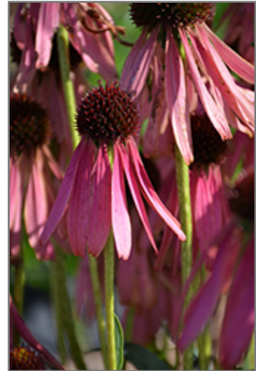
Rocket Man Coneflower flowers