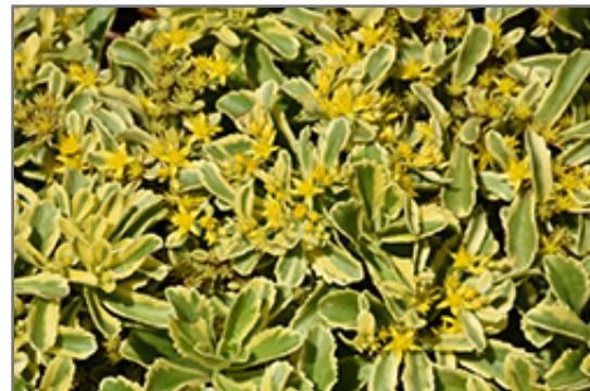
Cutting Edge Stonecrop flowers