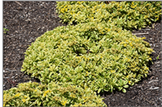
Cutting Edge Stonecrop

Cutting Edge Stonecrop is a fine choice for the garden, but it is also a good selection for planting in outdoor pots and containers. It is often used as a 'filler' in the 'spiller-thriller-filler' container combination, providing a mass of flowers and foliage against which the thriller plants stand out. Note that when growing plants in outdoor containers and baskets, they may require more frequent waterings than they would in the yard or garden.