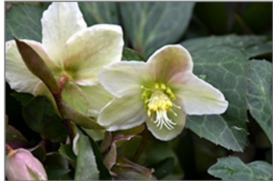
Raulston Remembered Hellebore flowers