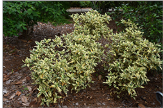
Variegated Gardenia