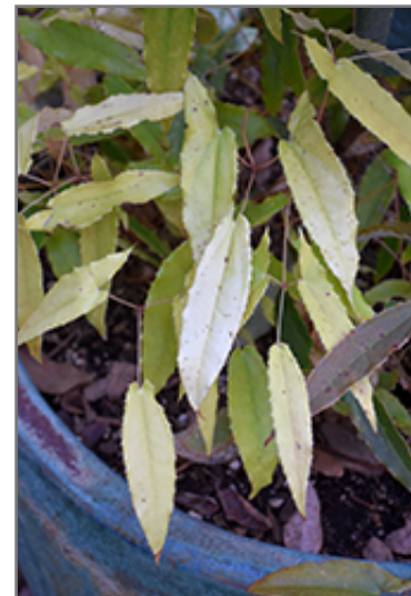
Wushan Fairy Wings foliage