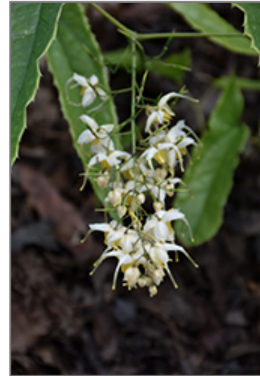
Wushan Fairy Wings flowers