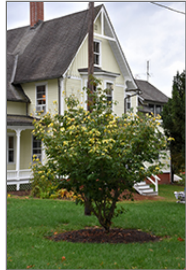
Champion's Gold Chinese Dogwood