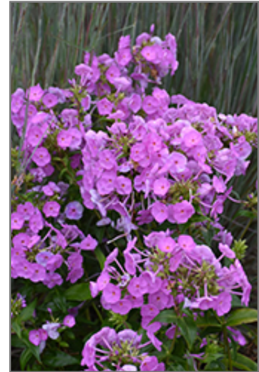
Fashionably Early Flamingo Garden Phlox flowers