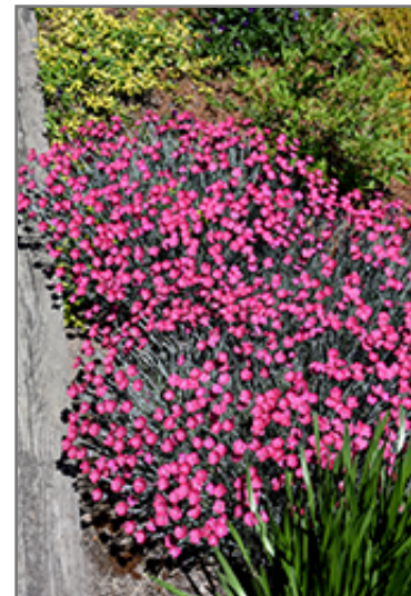
Wicked Witch Pinks in bloom