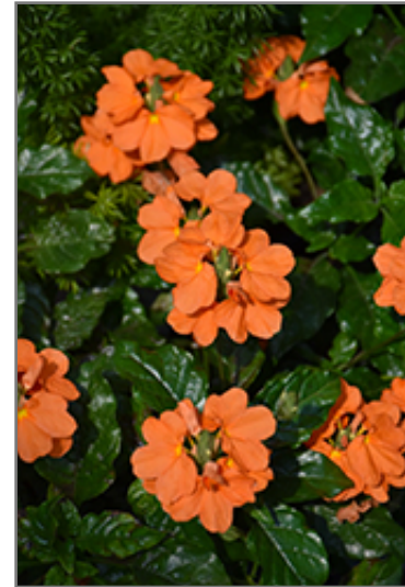
Orange Marmalade Firecracker Plant flowers

This plant does best in full sun to partial shade. It does best in average to evenly moist conditions, but will not tolerate standing water. It is not particular as to soil pH, but grows best in rich soils. It is somewhat tolerant of urban pollution. This is a selected variety of a species not originally from North America. It can be propagated by cuttings; however, as a cultivated variety, be aware that it may be subject to certain restrictions or prohibitions on propagation.