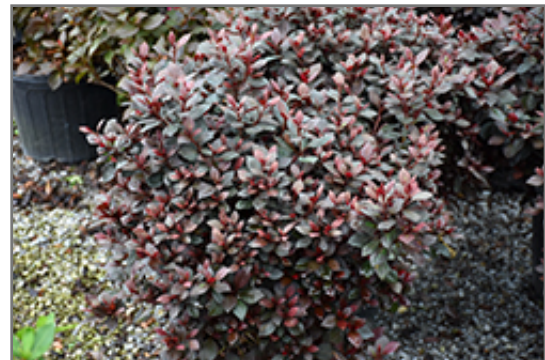
Crimson Majesty Azalea