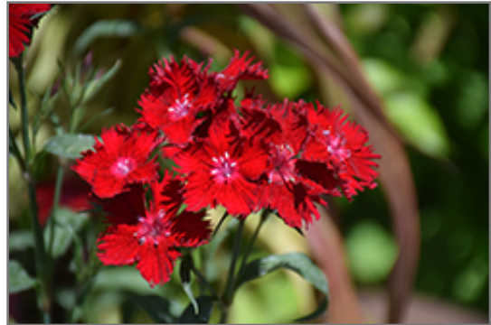
Rockin' Red Pinks flowers

This is a relatively low maintenance plant, and is best cleaned up in early spring before it resumes active growth for the season. It is a good choice for attracting bees and butterflies to your yard, but is not particularly attractive to deer who tend to leave it alone in favor of tastier treats. It has no significant negative characteristics.