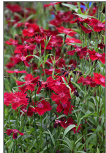
Rockin' Red Pinks flowers