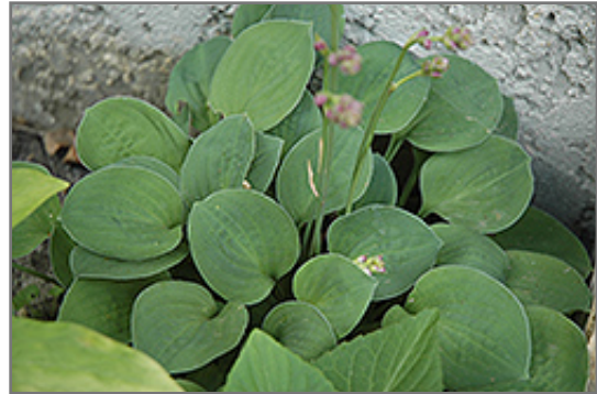
Baby Bunting Hosta foliage