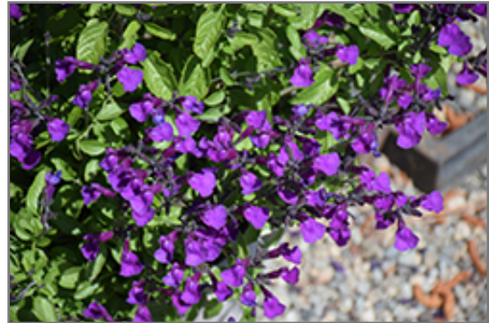
Vibe Ignition Purple Sage flowers