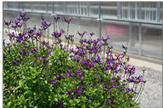
Vibe Ignition Purple Sage in bloom