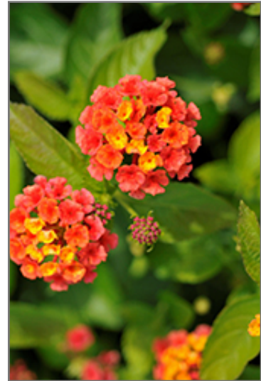
Landscape Bandana Red Lantana flowers

Landscape Bandana Red Lantana is recommended for the following landscape applications;