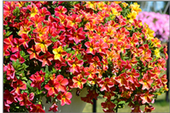
Aloha Nani Red Cartwheel Calibrachoa flowers

Aloha Nani Red Cartwheel Calibrachoa is recommended for the following landscape applications;