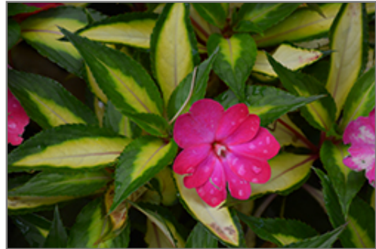
SunPatiens Compact Tropical Rose New Guinea Impatiens flowers