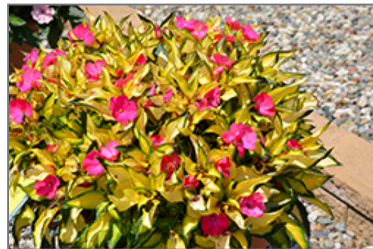
SunPatiens Compact Tropical Rose New Guinea Impatiens in bloom