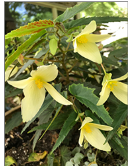
Bossa Nova Yellow Begonia flowers