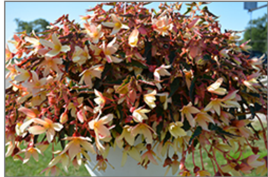
Bossa Nova Yellow Begonia in bloom

Bossa Nova Yellow Begonia is a fine choice for the garden, but it is also a good selection for planting in outdoor containers and hanging baskets. Because of its trailing habit of growth, it is ideally suited for use as a 'spiller' in the 'spiller-thriller-filler' container combination; plant it near the edges where it can spill gracefully over the pot. Note that when growing plants in outdoor containers and baskets, they may require more frequent waterings than they would in the yard or garden.