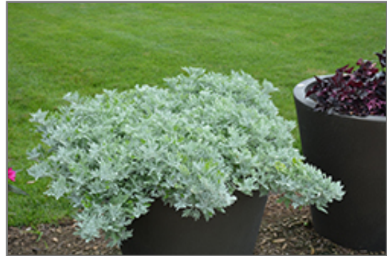
Silver Bullet Dusty Miller

This plant should only be grown in full sunlight. It prefers dry to average moisture levels with very well-drained soil, and will often die in standing water. It is considered to be drought-tolerant, and thus makes an ideal choice for a low-water garden or xeriscape application. It is particular about its soil conditions, with a strong preference for clay, alkaline soils, and is able to handle environmental salt. It is highly tolerant of urban pollution and will even thrive in inner city environments. This is a selected variety of a species not originally from North America. It can be propagated by division; however, as a cultivated variety, be aware that it may be subject to certain restrictions or prohibitions on propagation.