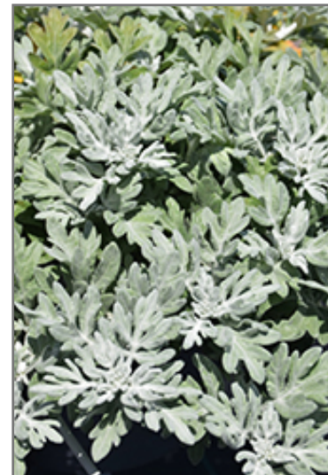
Silver Bullet Dusty Miller foliage