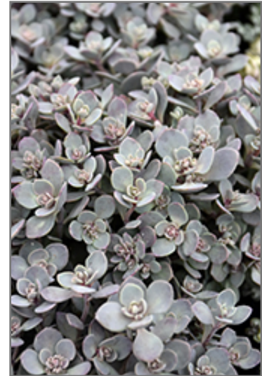
SunSparkler Blue Elf Sedoro foliage

SunSparkler Blue Elf Sedoro is a fine choice for the garden, but it is also a good selection for planting in outdoor pots and containers. Because of its spreading habit of growth, it is ideally suited for use as a 'spiller' in the 'spiller-thriller-filler' container combination; plant it near the edges where it can spill gracefully over the pot. Note that when growing plants in outdoor containers and baskets, they may require more frequent waterings than they would in the yard or garden.