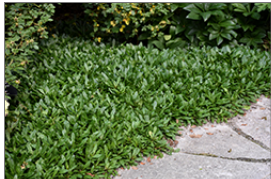
Emerald Chip Bugleweed