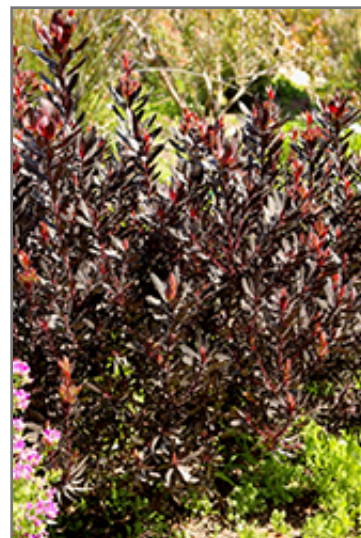
Ebony Conebush