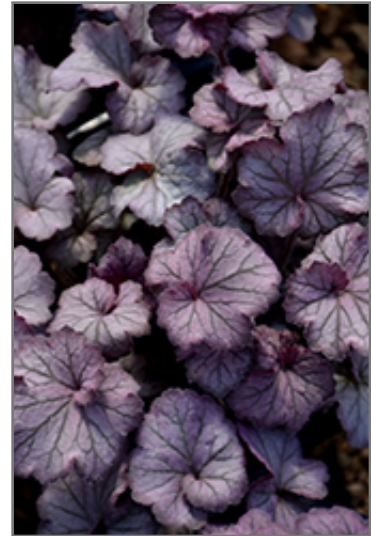
Northern Exposure Silver Coral Bells foliage

Northern Exposure Silver Coral Bells is recommended for the following landscape applications;