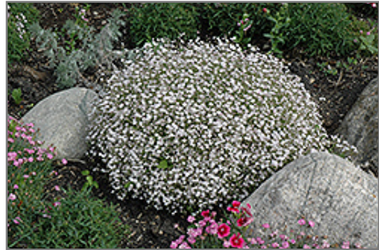
Creeping Baby's Breath in bloom