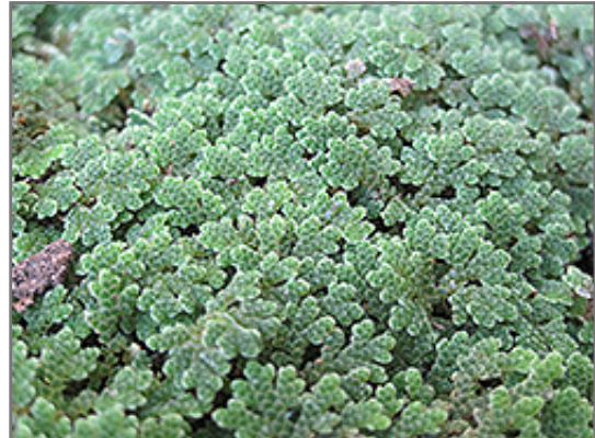
Mosquito Fern foliage