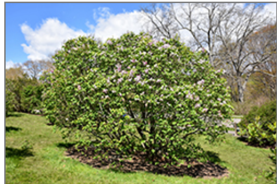
Necker Lilac in bloom