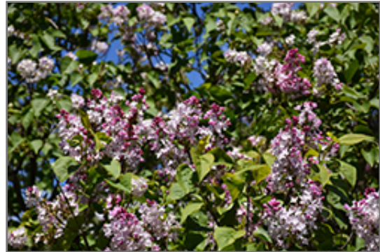
Necker Lilac flowers