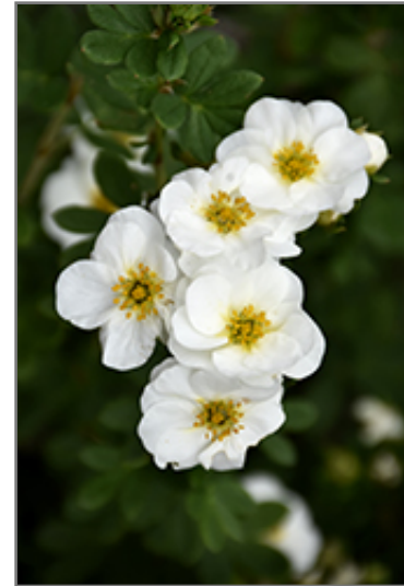
Creme Brulee Potentilla flowers