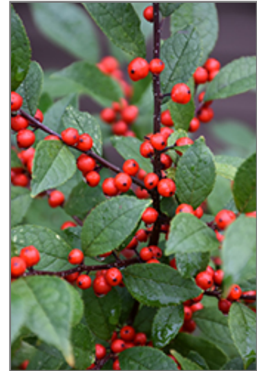
Scarlett O'Hara Winterberry fruit