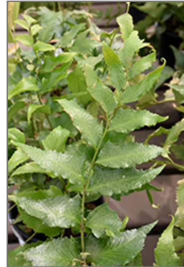
Rochfordianum Japanese Holly Fern foliage

This is an herbaceous evergreen houseplant with a shapely form and gracefully arching foliage. Its relatively fine texture sets it apart from other indoor plants with less refined foliage. This plant may benefit from an occasional pruning to look its best.